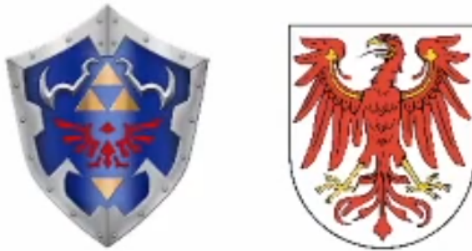
Brandenburg coat of arms. Region of Berlin, capital of Prussia. In the year of the shield's appearance (1991), this Brandenburg imagery might bring to mind the recent fall of the Berlin Wall ('89) and reunification of Germany ('90). These were events of major global interest at the time that LtTP was being developed and would hardly have been able to escape the attentions of the game's developers, whether or not

So the German state evolved out of the Holy Roman Empire, which was based in Central Europe, and here's their insane coat of arms, at first. We've got Jesus in the middle, we've got this scary red-eyed hawk, and then covered in all the heraldry, including Link's old shield. So this the Holy Roman Empire. And Brandenburg, specifically, is where we get this red bird. This is Brandenburg, where Berlin is located. And that's - basically, that's where we get the red bird on Link's shield, and - OK, fine, I can make up little games all I want - well, where do we get these other things? Where do we get this blue?