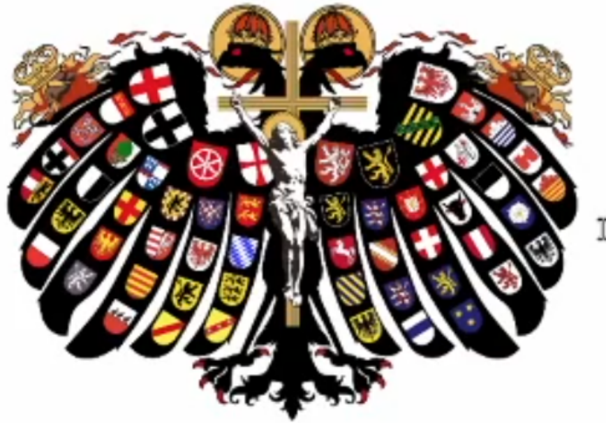
Quaternio of the Holy Roman Empire (c. 1510) as transitional object.